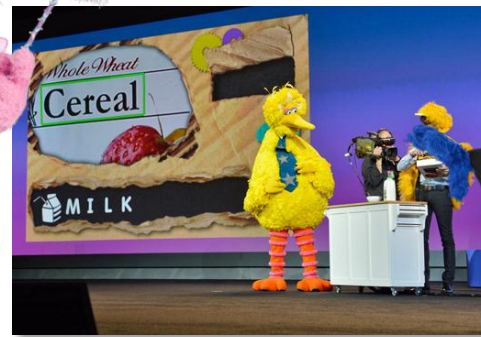
Big Bird's Words