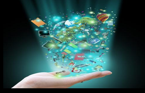
Exponential increase in connected devices with the UAE having one of the highest penetration rates in the world