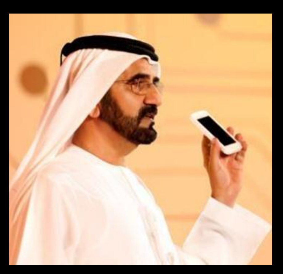
HH Sheikh Mohammed Bin Rashid Al-Maktoum launches Mobile Government initiative on a federal level