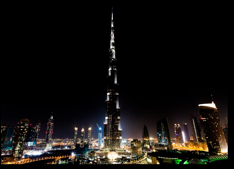
Dubai Down town – Burj Khalifa