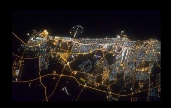
Dubai plans is working to be a "Smart City"