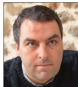
ARNAUD DANREE Remote SIM Provisioning for M2M