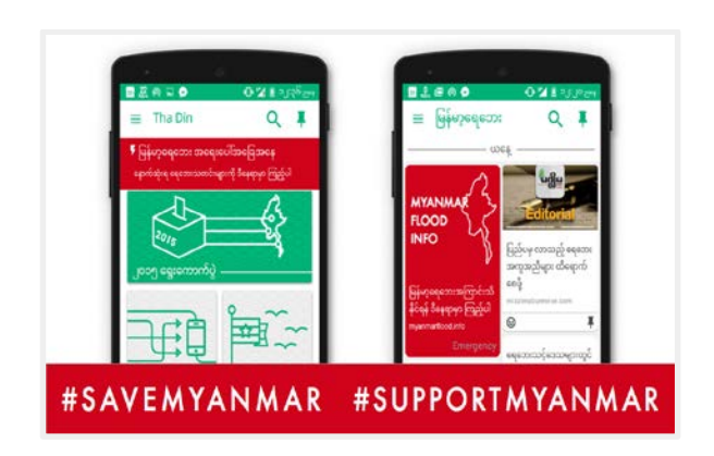
Figure 3: Bindez and the Myanmar Floods and Elections

Since then, the product has continued to develop in response to events. Within days of the July 2015 floods in Myanmar, the team had launched an 'Emergency News' category, that as able to bring all flood related news from across media sources in one central location. Similarly, a category was launched for the November 2015 General Election.