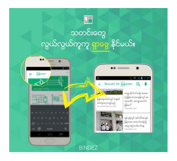
Figure 4: The importance of design thinking

An example of how this approach has informed of the UX of the product is found in the app's menu design. When testing, Bindez found that conventional long-press and hidden menus, common to many modern apps, were not appropriate in Myanmar due to users' lack of familiarity with this kind of design.