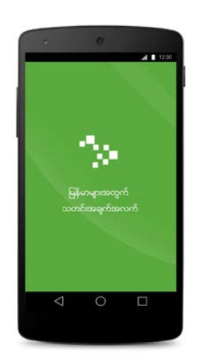
Figure 2: Bindez Private Beta Version (August 2014 to January 2015)

However, the team quickly grasped two key facts that shifted their approach slightly. First, was that the majority of people were connecting to the internet via smartphones. Second, given the limited exposure that many of these users had to the internet, a more curated experience would be necessary in order to make the Internet relevant to a larger percentage of the population. As a result they launched a News Search App prototype in Nov 2014 in order to address the need for a service that can connect users with news in politics, business, sport and entertainment.