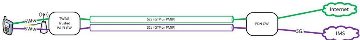
Figure 3 VoWiFi on trusted WLAN based on SWw and S2a (3GPP Rel-12 & eSaMOG)

Terminals may support the SWw interface for connection to the Trusted Wi-Fi Gateway, TWAG. The TWAG connects to the Packet Data Network Gateway, PDN GW, via the S2a interface. This will allow for delivery of IMS based services over trusted Wi-Fi networks.