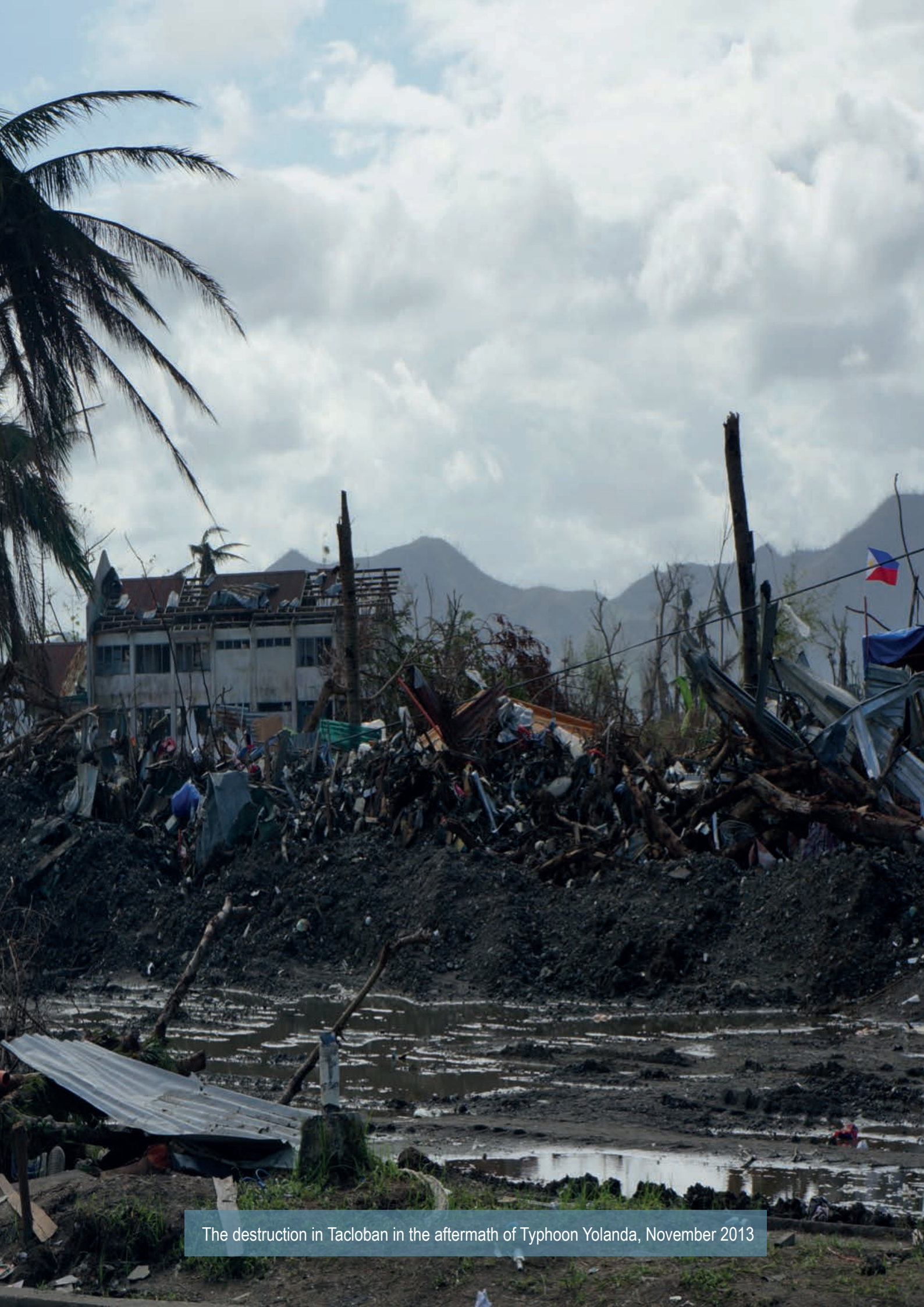
The destruction in Tacloban in the aftermath of Typhoon Yolanda, November 2013