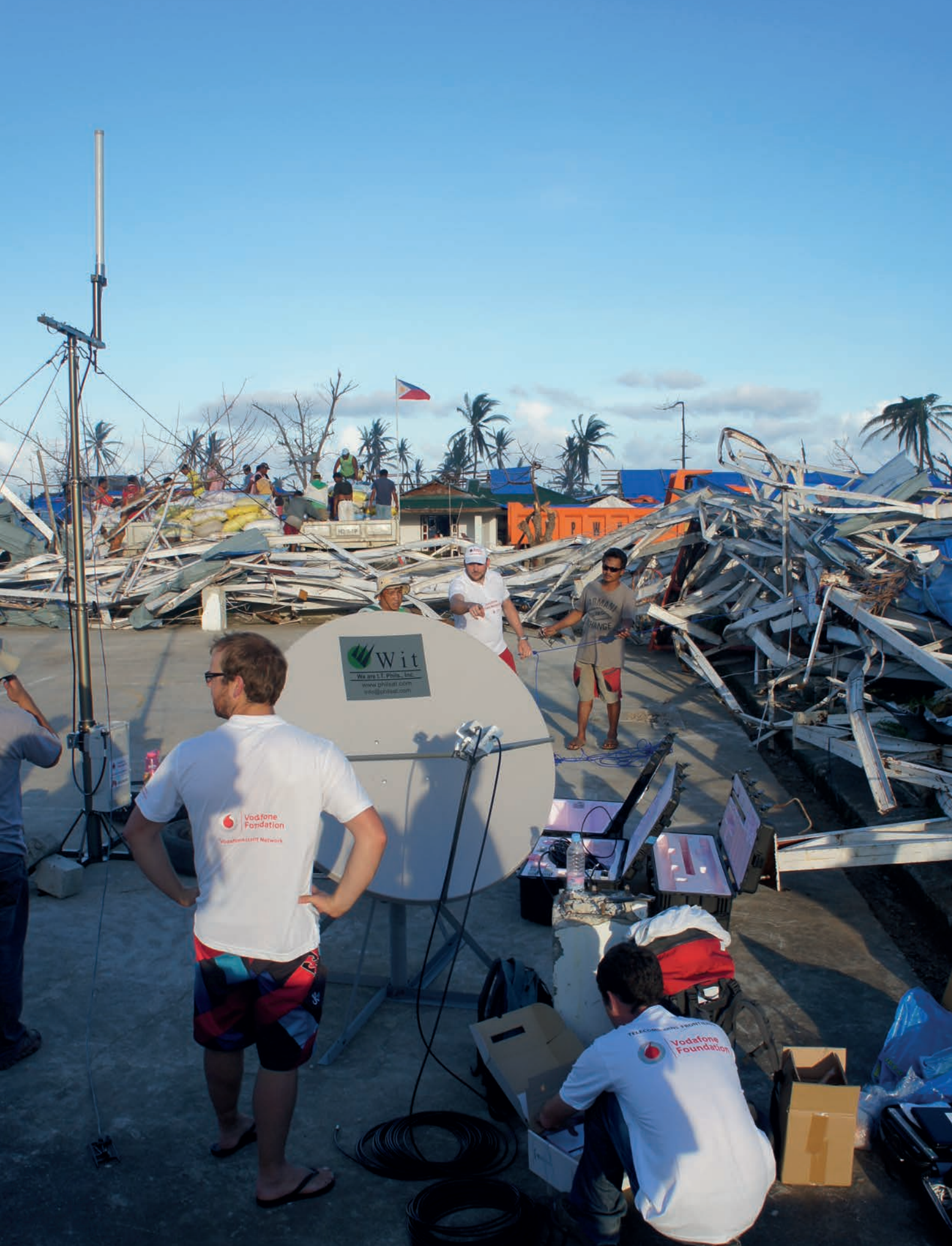
Vodafone Foundation Volunteers setting up the Instant Network in the Philippines after Typhoon Bopha, December 2012