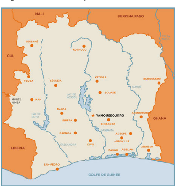
Figure 1: Côte d'Ivoire map

The Republic of Côte d'Ivoire is a coastal country located in West Africa, sharing its borders with Ghana, Burkina Faso, Mali, Guinea and Liberia. The country, with a national territory spanning 322,462 km², is divided into 14 districts, 33 regions and 8,513 localities.<sup>3</sup> Yamoussoukro is the political capital, while Abidjan is the heart of the country's financial activities.