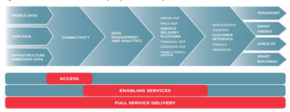
Figure 2: Mobile for smart service delivery: Beyond connectivity

These MNO services can be bundled into three levels of business offerings: access, enabling services and full service delivery as show in figure 1 below.