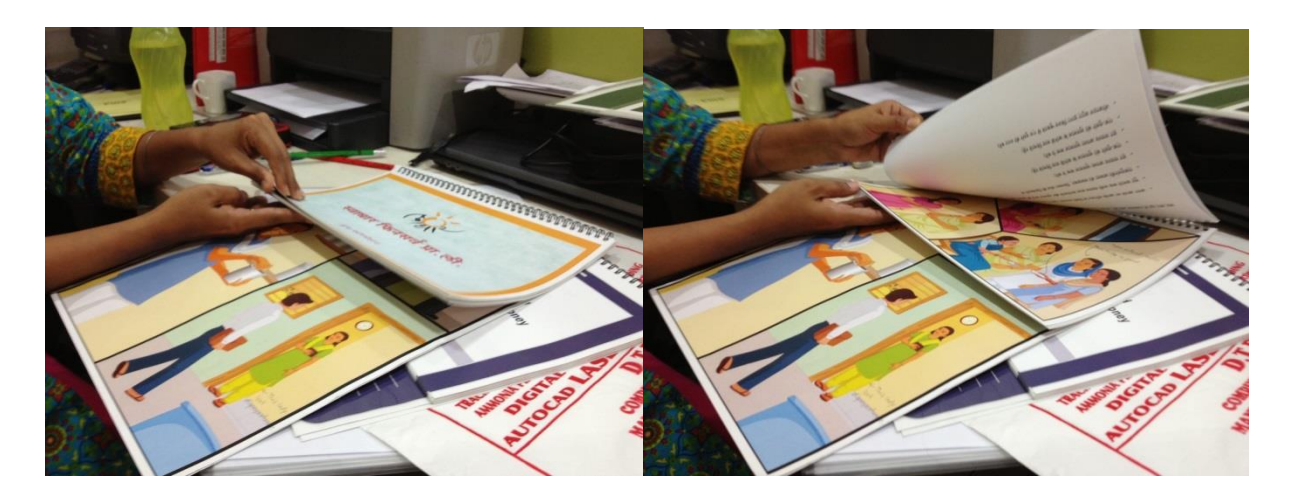
Figure 2: The Story of Suman

In addition to the visuals and simple language, analogies were used to explain and demystify the mobile wallet and the telecom jargon that sometimes creeps into mobile services. Swadhaar customers were taught that their mobile money accounts are like their purses, that the MPIN is their personal key, and that their money is in the bank and not in the phone. Using the right language helped to ensure the concepts were easily understood and it also promoted trust in the service.