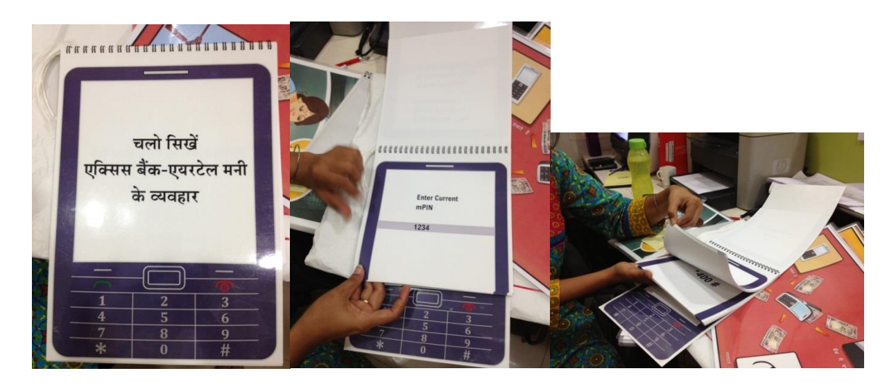
Figure 4: Mobile handset mock-up

Once the core concepts of mobile money were laid out, mobile handset mock-ups were used to explain how to use the Airtel Money service, as shown in Figure 4. This practical step-by-step demonstration helped Swadhaar customers familiarise themselves with the keys and symbols used on the handset and the mobile money user interface. This step was particularly important as some Swadhaar customers either did not have a handset, or made limited use of it beyond pressing the red and green buttons to receive a call and hang up. Hands-on experience and practice was critical to customers overcoming their fear of doing something wrong and losing their money.