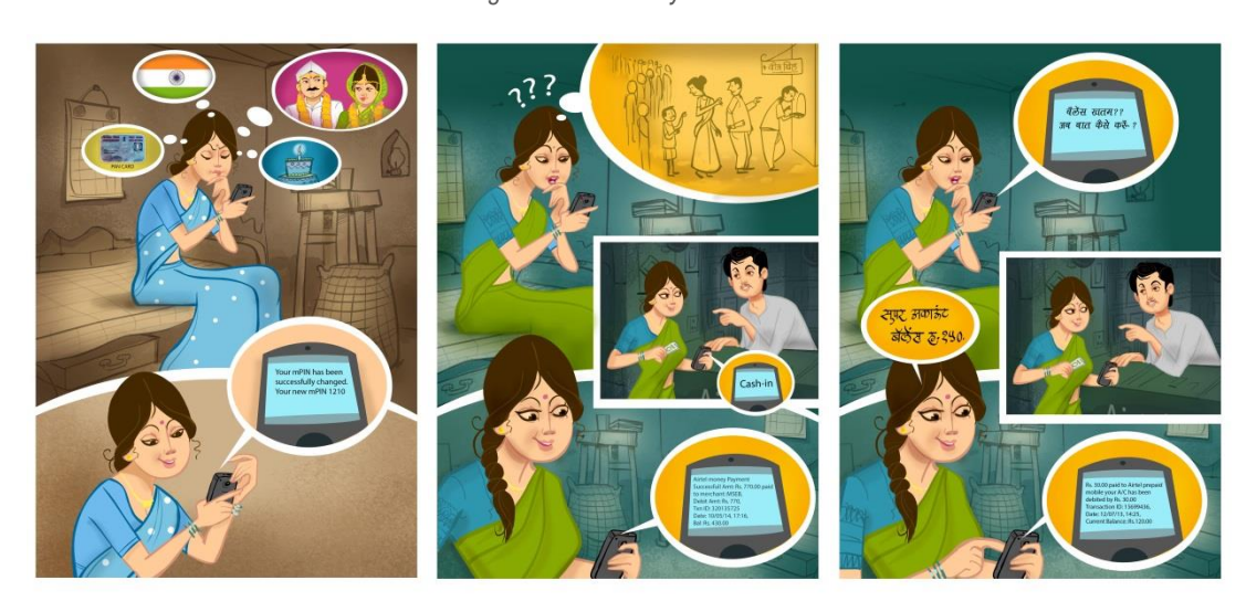
Figure 3: Animated story

The storyteller (loan officer or trainer) holds up the poster or flip chart. While the customer looks at the images, the storyteller describes the story with the help of key talking points written on the back of the pictures.