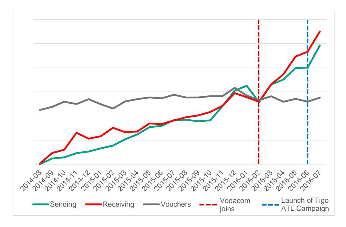
Figure 2: Tigo interoperable transaction growth by volume (Aug 2014 to Jul 2016)