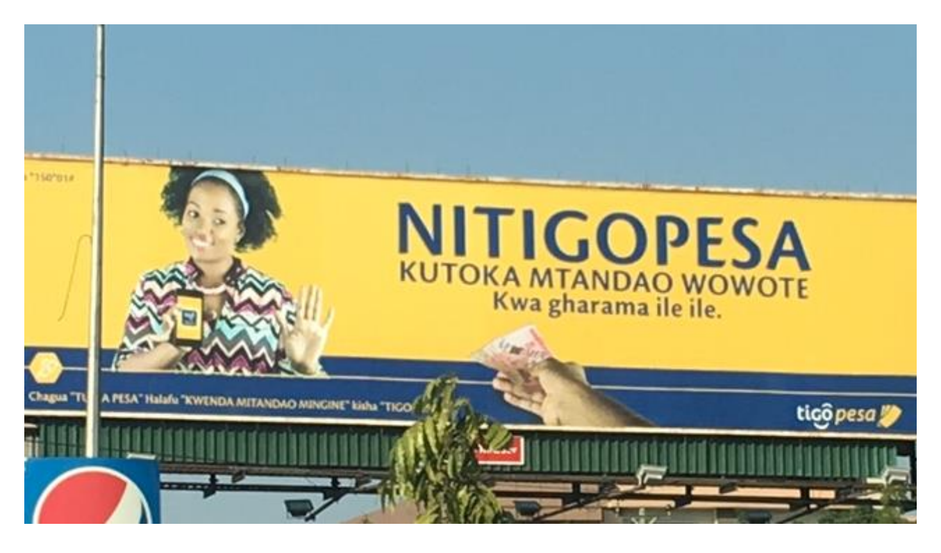
Image 1: Example of Tigo Pesa's marketing campaign. The billboard reads "Send money to Tigo Pesa from any network at the same fee."

Account-to-account interoperability between the mobile money providers is only starting to move beyond what could be considered a soft launch in Tanzania. While the service was technically available in 2014, only recently have providers put their full weight behind it with marketing campaigns. As this was such a new service in the market, providers took a "wait and see" approach, which allowed them to capture some insights on organic growth that were particularly noticeable amongst loyal customers. Confidence in the technical and operational functionality of the service has grown, and providers are now starting to actively promote and encourage usage. Airtel initiated with early radio and below-the-line (BTL) marketing campaigns that included price promotions. More recently, Tigo has launched a larger above-the-line (ATL) marketing campaign, encouraging any user to send money to Tigo Pesa (see Image 1).