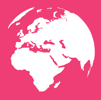
Region 1: Europe, the Middle East, Africa, Russia and Mongolia

The International Telecommunication Union (ITU) divides the world into three regions for the purpose of managing radio spectrum availability.