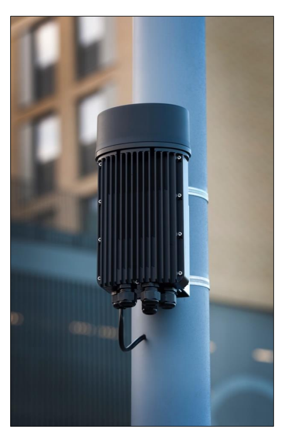
Figure 2: Metnet 60GHz Mesh Radio

Metnet 12Gbps 60GHz mmWave is the first product release within CCS's new Software-Defined Network architecture, and is part of the evolutionary roadmap towards nextgeneration radio. Multiple distributed Metnet 60GHz nodes combine to provide an SDNcapable networking switch, which can be managed either through the Metnet Element Management System (EMS) or a third-party management system acting as an OpenFlow SDN controller.