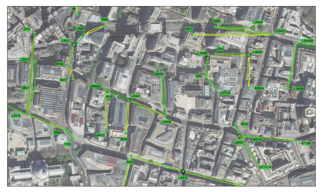
Figure 3CCS view of deployed backhaul network