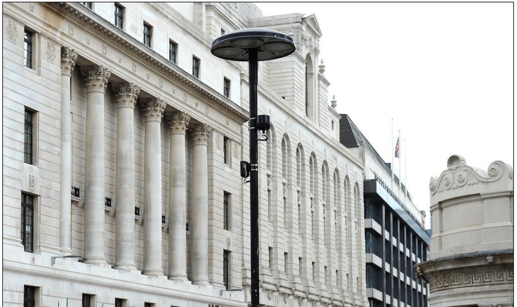
Figure 1: Metnet 28GHz pre-5G in the City of London