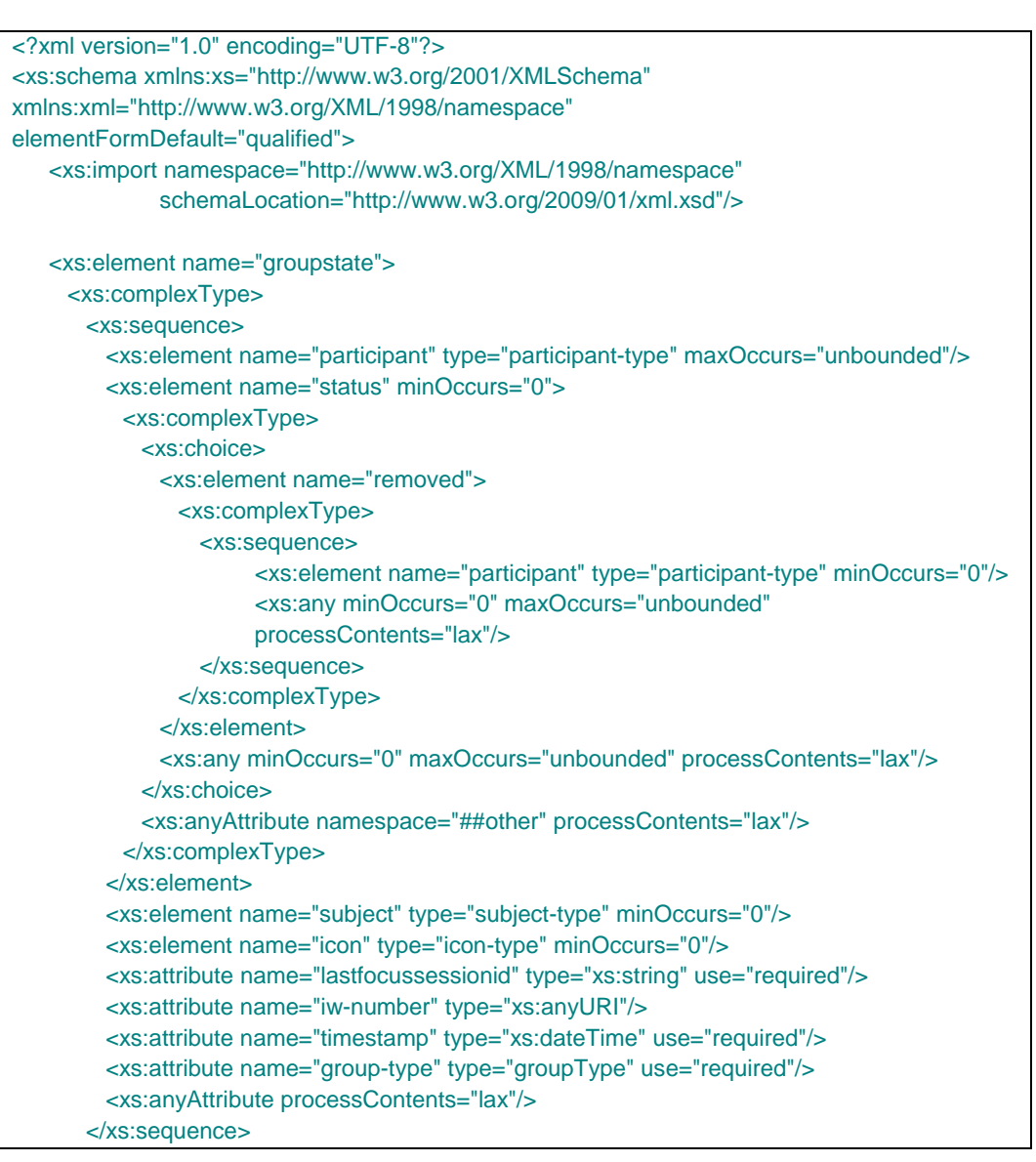
Table 1 in section 5.2.4 of [RCC.09-v6.0] shall be replaced by the following: