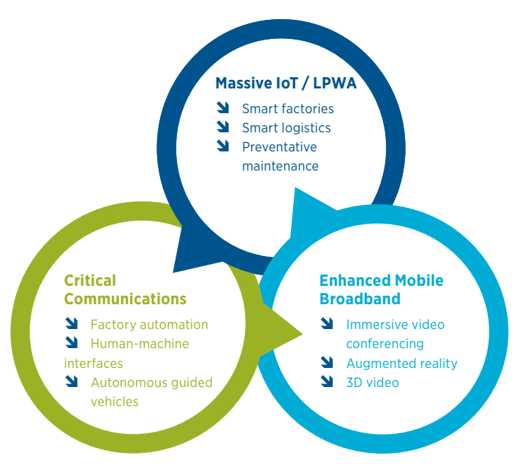
Figure 4: Example 5G Use Cases

Figure 5 presents a range of application categories for Massive IoT LPWA. LTE-M and NB-IoT have already been designed to address the requirements of these use cases, including support for a large numbers of devices, low device cost, ultra-long battery life, and coverage in challenging locations. These requirements will still apply for Massive IoT in the 5G context.<sup>10</sup> In addition, Mobile IoT networks can support a high connection density in terms of number of connections in a given geographical area and spectrum allocation.