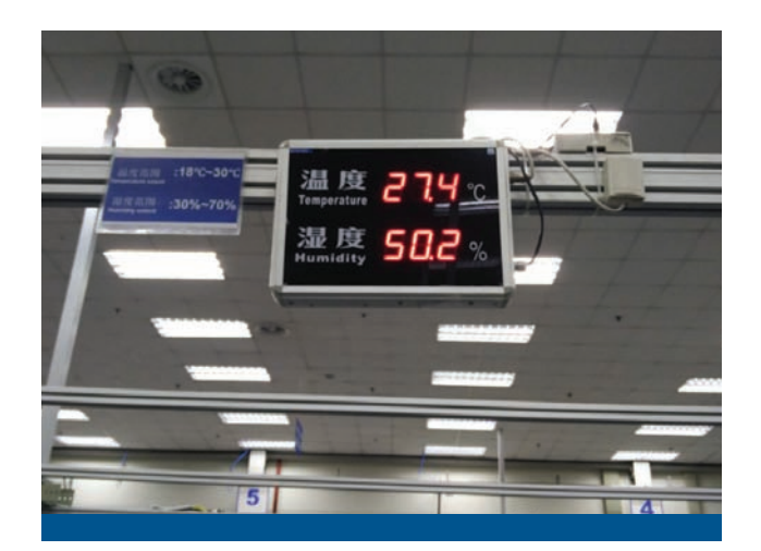
Figure 9: Factory Environmental Monitor

maintenance, in turn extending the life time of the screwdrivers. The solution has reduced maintenance material costs by US$1,000 each year and manual maintenance work costs have been cut in half, saving US$10,000 annually.