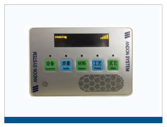
Figure 7: Andon call system

Ericsson has connected multiple systems and sensors in its factories using Mobile IoT technology. For example, the telecoms equipment maker employs a wireless Andon system to enable operators on its production lines to call for technical support when a quality problem occurs. This Mobile IoT solution has replaced an inflexible wireline system in which the shift leader got the call on his or her screen and then had to manually find the right engineer to address the problem. The new LTE-M solution uses voice over LTE (VoLTE) to make a call directly to the right engineer from the line, reducing the lead-time for problem solving.