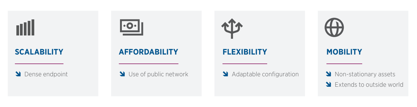
Figure 3: Key Benefits of Mobile IoT technologies

Cellular technologies are also well-suited to meeting the security and privacy requirements of industrial players, as they benefit from security layers that harness years of experience in dealing with various security challenges and learnings from previous generations of cellular systems.