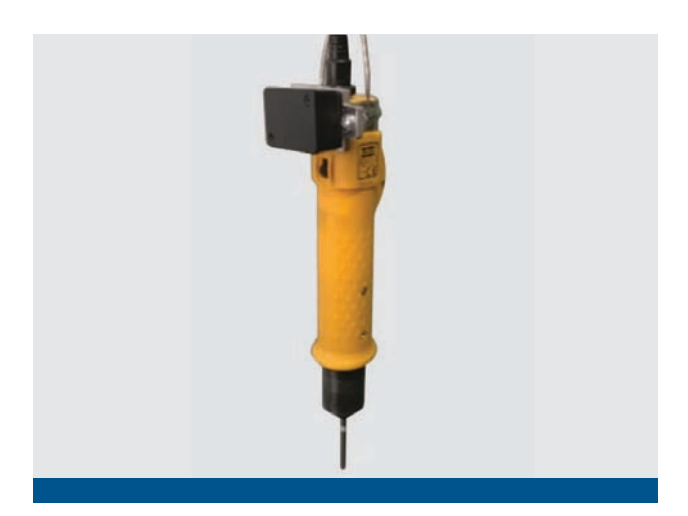
Figure 8: High-precision screwdriver

Moreover, the Ericsson Panda manufacturing plant in Nanjing, China, uses NB-IoT to capture data from high-precision screwdrivers via attached motion sensors. The sensors are used to measure the usage of the devices so that they can be torque calibrated efficiently at the correct time interval. Previously the screwdrivers were calibrated at fixed time intervals and the information was recorded in hand written logs. With the NB-IoT enabled sensor, data is captured every eight hours allowing the private cloud system to analyse the performance of the tools, enabling predictive