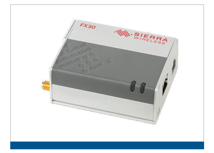
Figure 13: The Sierra Wireless FX30 IoT Gateway can help to monitor the usage of compressors

Figure 12: Atlas Copco Z-Series compressor and remote monitoring solution