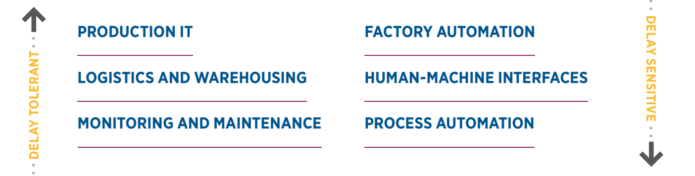
Figure 2: Delay sensitivity for different Industrial applications

Whilst a number of industrial application categories require very high-performance requirements (e.g. low latency and fast response times), there are a number of categories that can be supported by Mobile IoT today, as there are no strict latency requirements. Moreover, within each application category there are a variety of use cases with differing performance requirements, which also means that several use cases within each category may already also be implemented using Mobile IoT (see Figure 2).