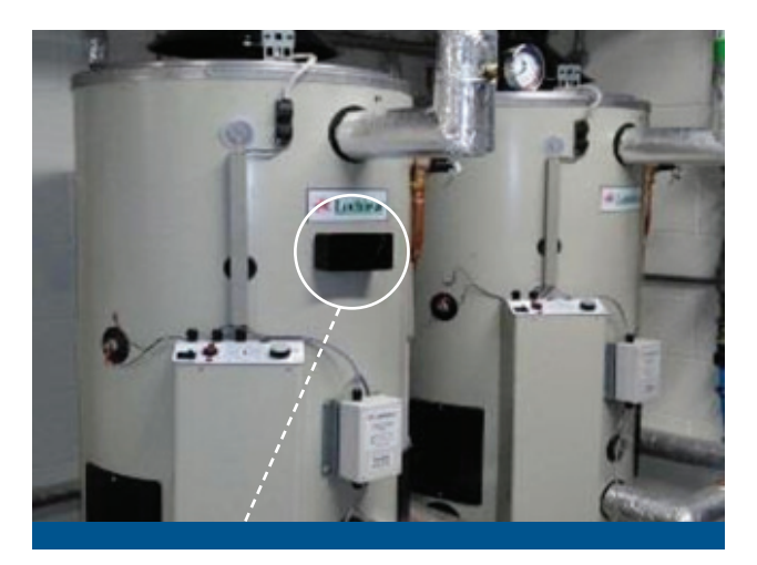
Figure 10: A connected monitor from Horus attached to factory equipment

The low power usage of NB-IoT enables the device to be battery powered, while its extended coverage allows for deep penetration in the types of environment that the Sentinel will be deployed in. "The use of wireless connectivity means deployment can be low cost, at less than €100 (US$115) for each device, making it feasible to monitor large numbers of assets, in turn increasing the overall saving potential" says Patrick Robinson, VP Sales and Marketing Horus IoT. The mitigation of major