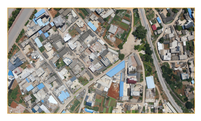
Figure 3 Natural Gas and Petroleum Pipeline Inspection

China Unicom says the replacement of manual operations with UAVs is achieving outstanding results in safety, cost reduction and efficiency: The solution has cut the time it takes to perform an inspection by about 40% and the human costs by 57%. The UAV service is set to generate RMB 30 million income per year for China Unicom.