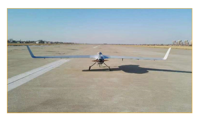
Figure 1 Hybrid wing high-altitude long-endurance UAV

The project is supporting industrial flight missions by hybrid wing high-altitude long-endurance UAVs (see Figure 1) with a flying height of 1,000 meters.