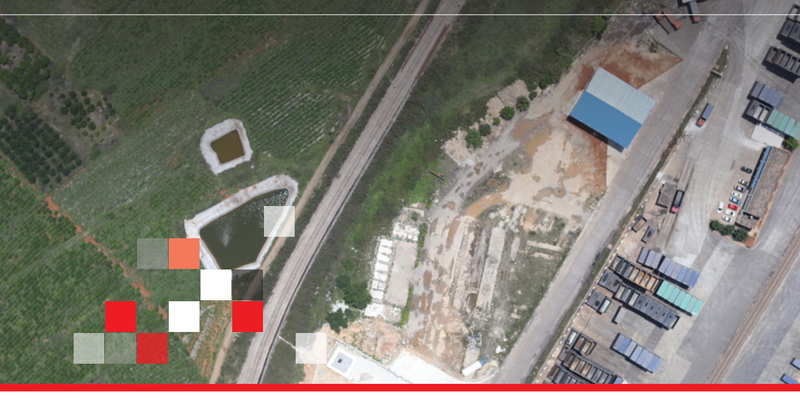
Figure 2 Natural Gas and Petroleum Pipeline Inspection

The service distribution platform operated by China Unicom relays the information acquired by the drone from the ground control centre to the local network management centre.