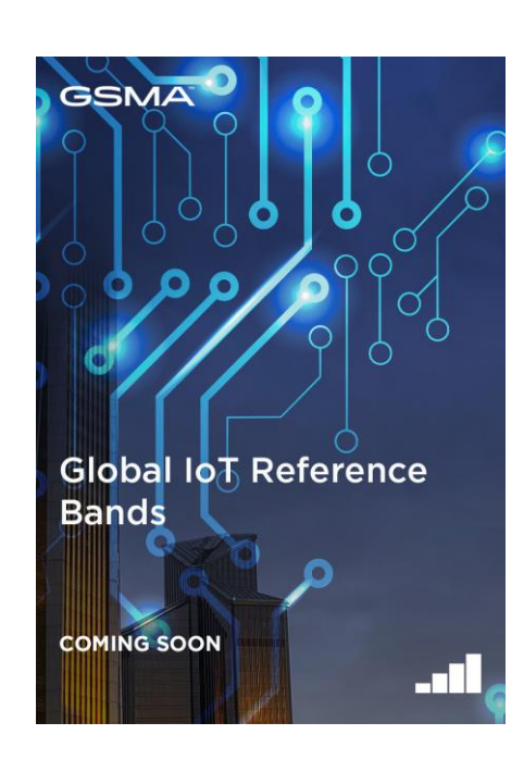
Know IoT Spectrum