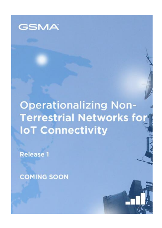
IoT in Satellite Networks