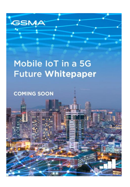
The Future of Massive 5G IoT