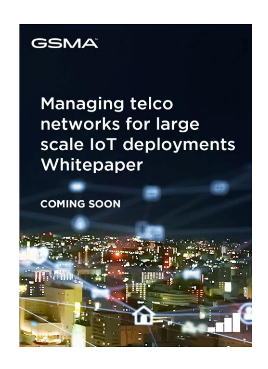
Protecting IoT Networks