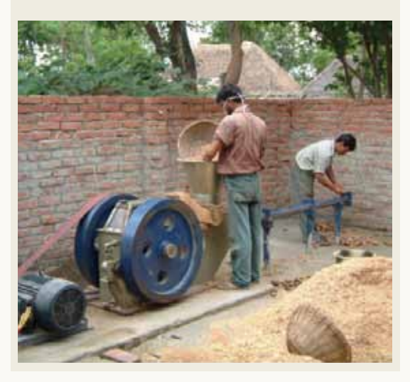
Figure 17: Local Entrepreneurs in Gaiyari

DESI Power's 75 kWh biomass gasifier based power plant in Gaiyari is currently supplying power to a Bharti Infratel tower and a Vodafoneowned tower which is shared by Vodafone, Idea Cellular and Tata Docomo equipment. However, the difference in load provided by telecom towers and other consumers is due to the fact that telecom towers provide a continuous load to the DESI power plant for 6-7 hours everyday (when the power plant runs) whereas power is supplied to other consumer based on their need as all the consumers may not be using power all the time.