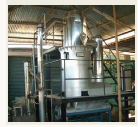
Figure 16: DESI Power Gasifier

power plant in Bahabari, DESI setup a second similar gasifier based power plant of capacity 61 kW in Vebhra village in Araria district, followed by two more gasifier power plants of capacity 75 kWe in Gayari village and Zero Mile area of Araria district in 2008. Despite the success of DESI Power in creating a thriving local economy in the Araria district by setting up multiple power plants that use locally available feedstock, achieving commercial returns from the operation of these power plants was still a challenge. Hence, DESI Power became a part of the Rockefeller Foundation-led SPEED project to increase the financial viability of its power plants by powering local telecom towers, adding a strong anchor load customer to the power plants. The SPEED project team conducted a market research and developed business models for this purpose, following it up with their first set of pilots which involved connecting the existing 4 DESI power plants in Araria to telecom towers. The process of connecting DESI's power plants to these telecom towers began in June 2010 and the current status (as of March 2011) is as shown in the table below: