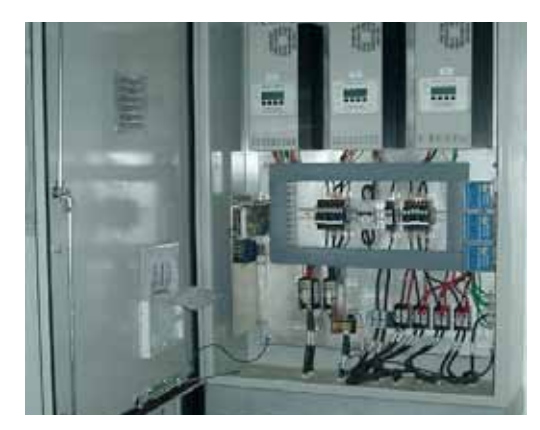
Apollo Solar PVforTelecom System® in IP66 Enclosure

Apollo Solar now provides a new generation of highly reliable and highly efficient Complete Off-Grid PV Power Systems in a full line of inverters, charge controllers, and communications modules, quickly integrated through modular design for fast, fail-safe installation and use.