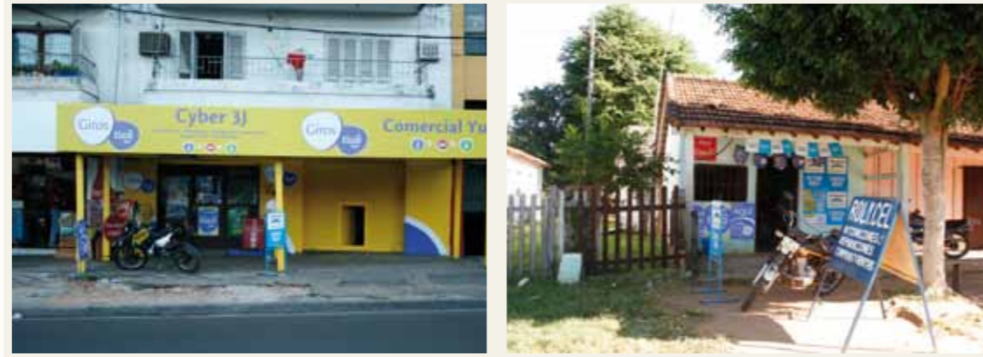
Fully branded agent point with Giro Tigo yellow; new agent in rural area with partial branding