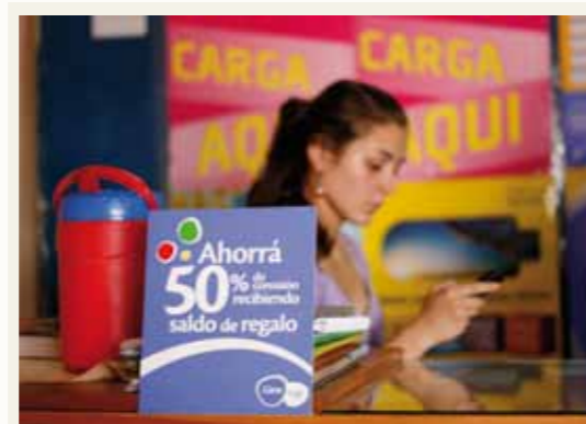
“Save: 50% of commission paid will be gifted as airtime”

From the experience with Tigo Cash, Tigo knew brand awareness alone did not drive customer activation. For the launch of Giro Tigo, Tigo developed communications that introduced first, what Giro Tigo was, second, showed consumers how it could be useful to them in their daily life and third explained exactly how it worked. The first TVC that launched highlighted the benefits and uses of Giro Tigo. The second TVC that launched utilised the same cast acting as the first TVC, but this time, the cast acted out the step by step actions required to make a transaction.