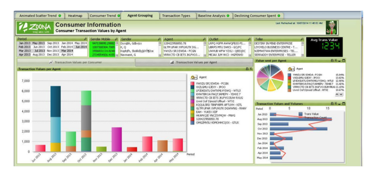
Figure 2 - Zoona dashboard snapshot

off points, and to segment their user base.