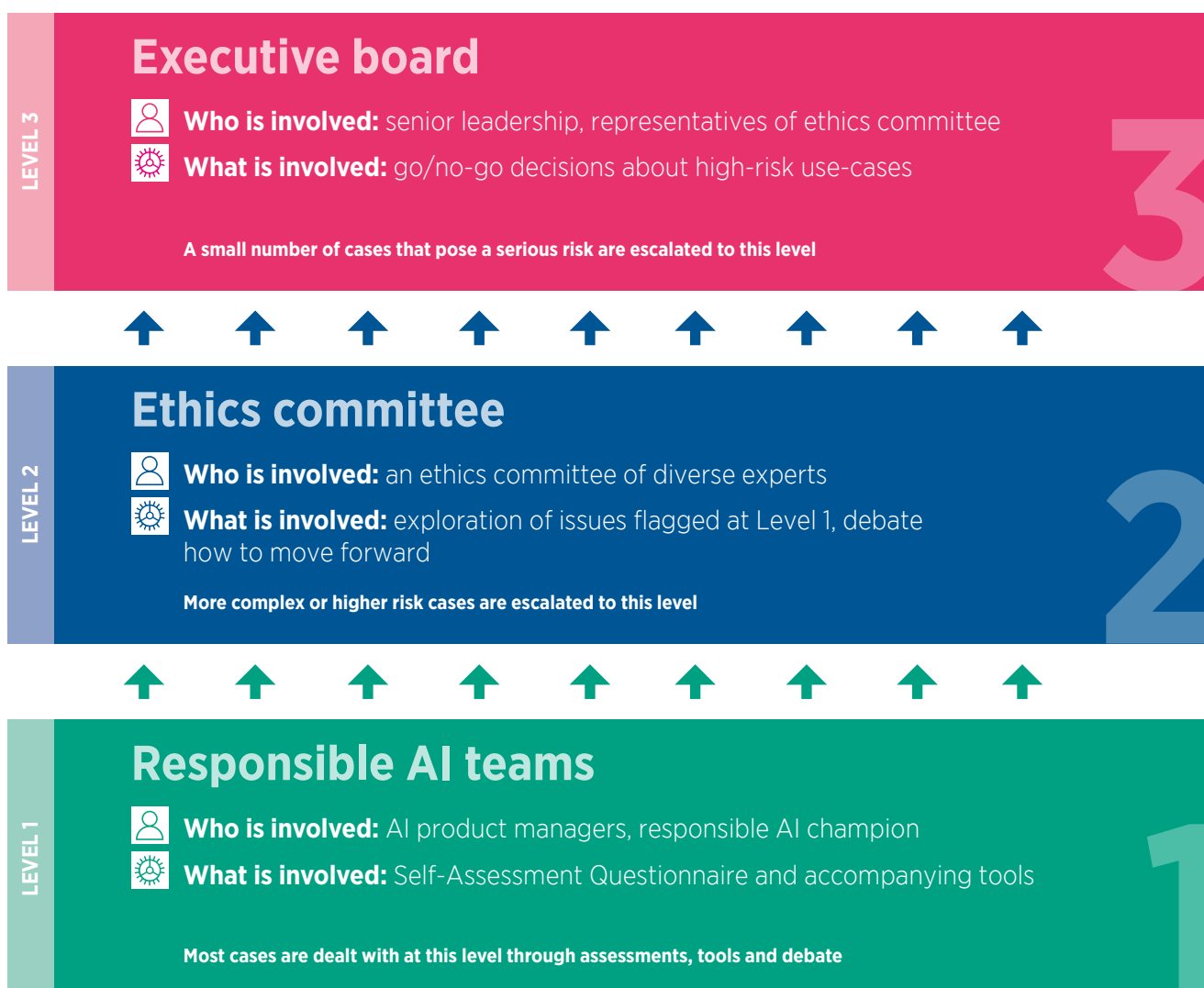
Figure 1 Organisational model designed to provide escalation for ethical issues

The proposed governance structure has three levels. These levels indicate the process for escalating higher risk or more complex use-cases.