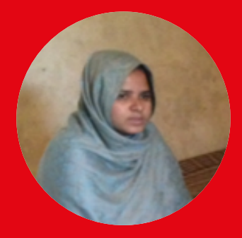
PROFILE 2 Zubina, Pakistan

'Unmarried girls should not have a mobile. People here find it bad and not acceptable.'