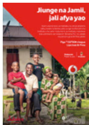
Dial the M-Pesa menu (*150*00#) and pay via M-Pesa/no transaction fees.

“As Vodacom Tanzania, we partnered with Jamii as we saw the demand in the micro health insurance space that we had not ventured into before as a telecom company. The partnership allows us to complement our existing corporate social responsibility seeing that we not only provide the usual MNO services, but are also able to avail affordable micro health insurance to the informal sector, which in turn reduces our churn rate and increases M-Pesa usage. The partnership with Jamii is rather exemplary and we are positive we will replicate the same in other countries where Vodacom is present in a bid to serve the underserved through a cashless and paperless micro health insurance product.”