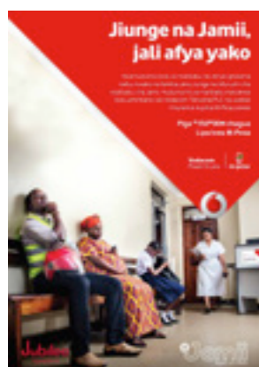
Subscribe and buy a Jamii cover to take care of your health.