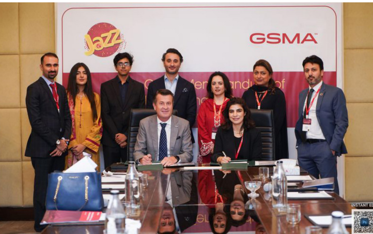
Signing of the GSMA-Jazz Statement of Commitment at the GSMA Digital Nation Summit in Islamabad, Pakistan, 7 August 2024.

In Haiti, the M4H programme supported a collaboration between Digicel, Futura Labs and the government to design and deploy an EWS that built on the programme's experience in Sri Lanka launching the Disaster and Emergency Warning Network (DEWN). The DEWN-based system in Haiti was successfully tested in 2024 and is now being integrated in national EW4All plans.