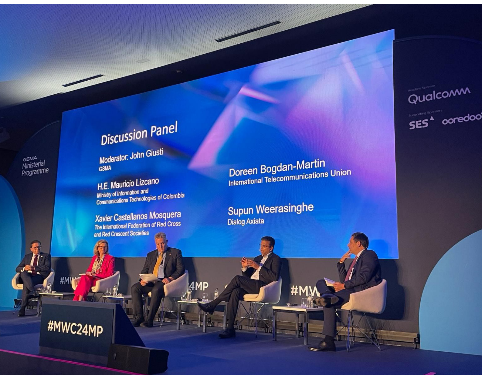
Panel discussion at MWC Barcelona 2024, "Early Warning Systems: the Power of Partnership"

On the sidelines of the GSMA's M360 event in Seoul, South Korea, in October 2024, the M4H programme briefed the GSMA Board and Policy Group on the EW4All Initiative, which has fostered increased engagement from the industry and led to regional and country-level developments in EWS.