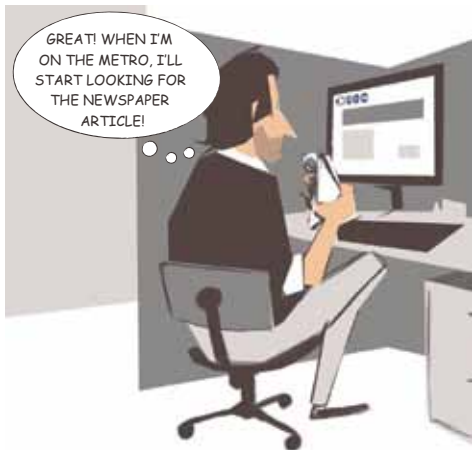
At lunchtime, now at work , the lecturer has already answered his email...