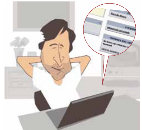
After dinner, he starts to read the newspaper articles uploaded by the other students in the work group and to do the assignment.