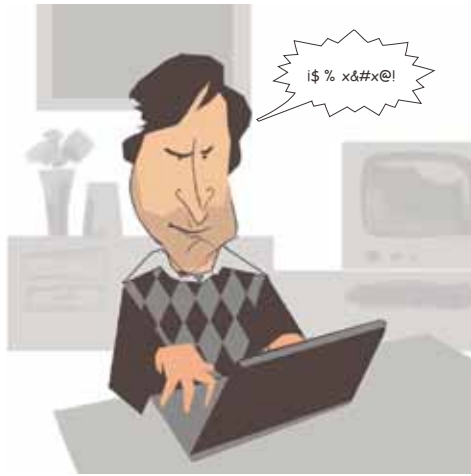
At home: Today is the last day to submit the assignment...

Works in accounting Studies Business Administration and Management Motivation: Enhance his career prospects