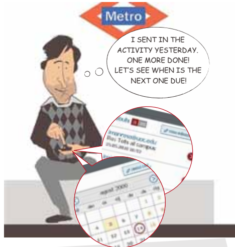
He catches the metro every morning to work . While he is waiting for the train...